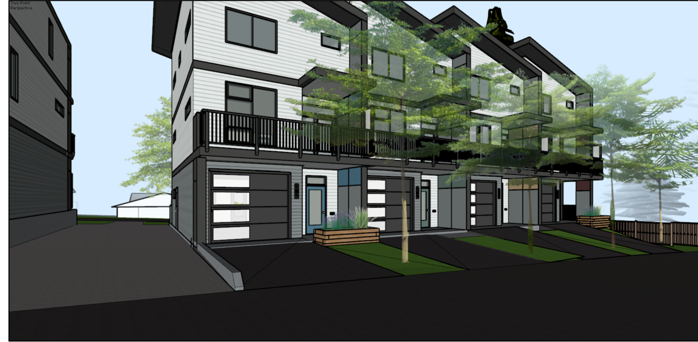
2 Looking at Building 2 Typical Front N.T.S.