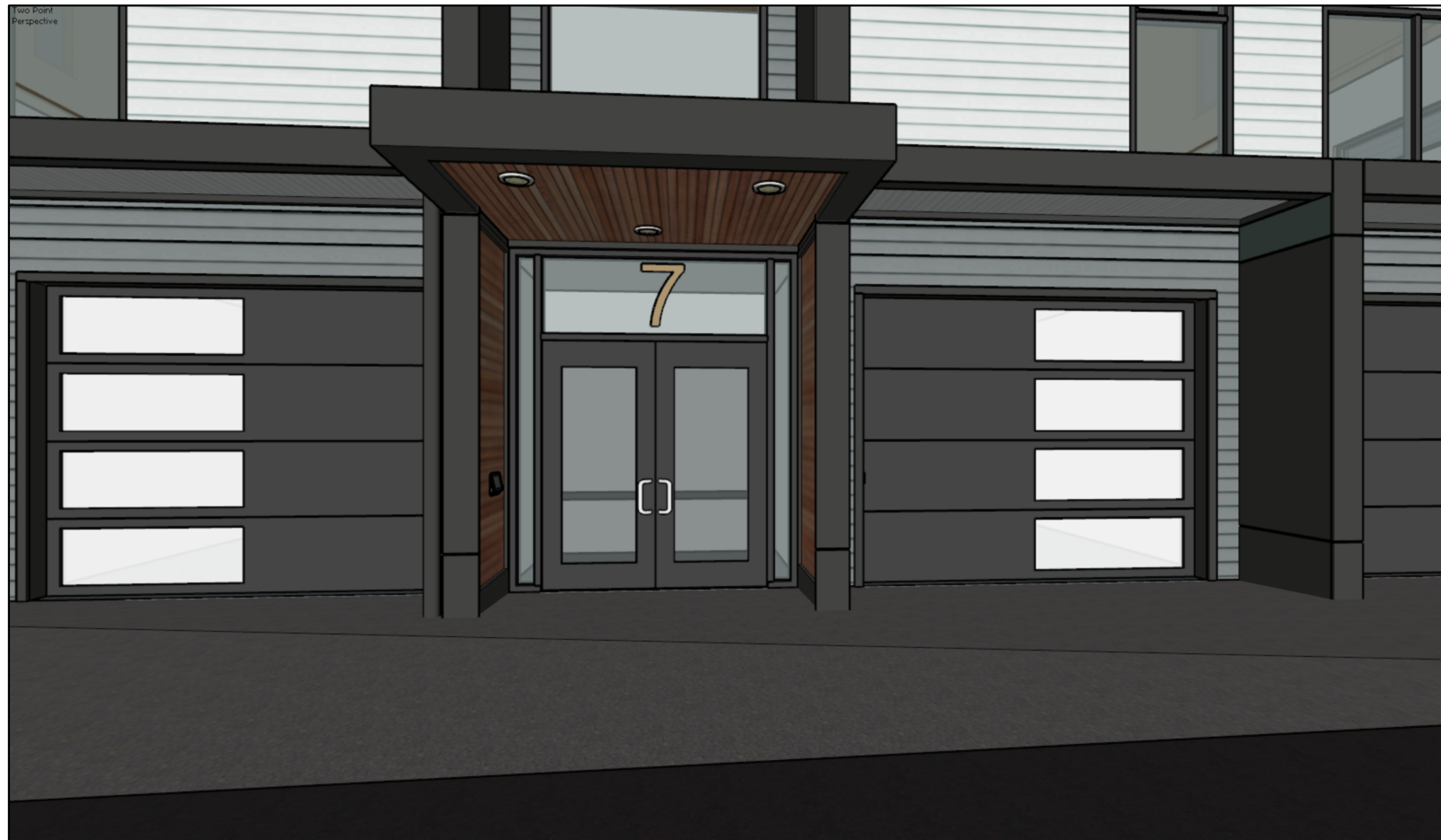
3 Typical Front Entrance N.T.S.