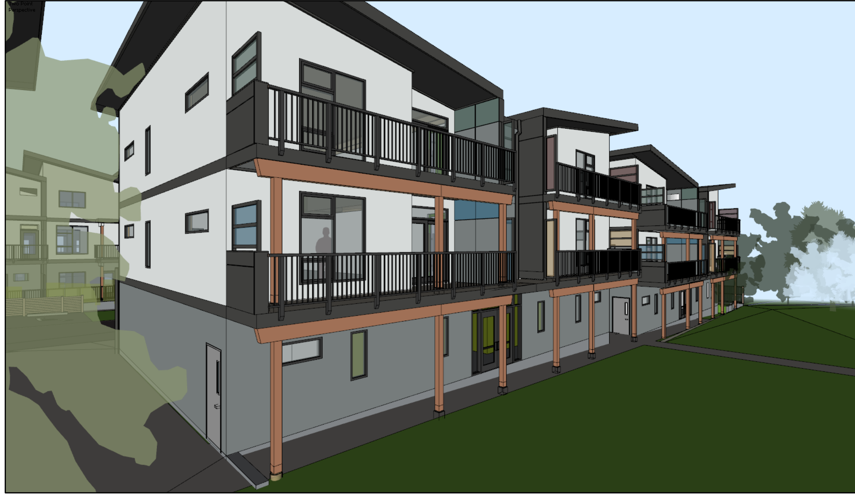
1 Typical Rear N.T.S.