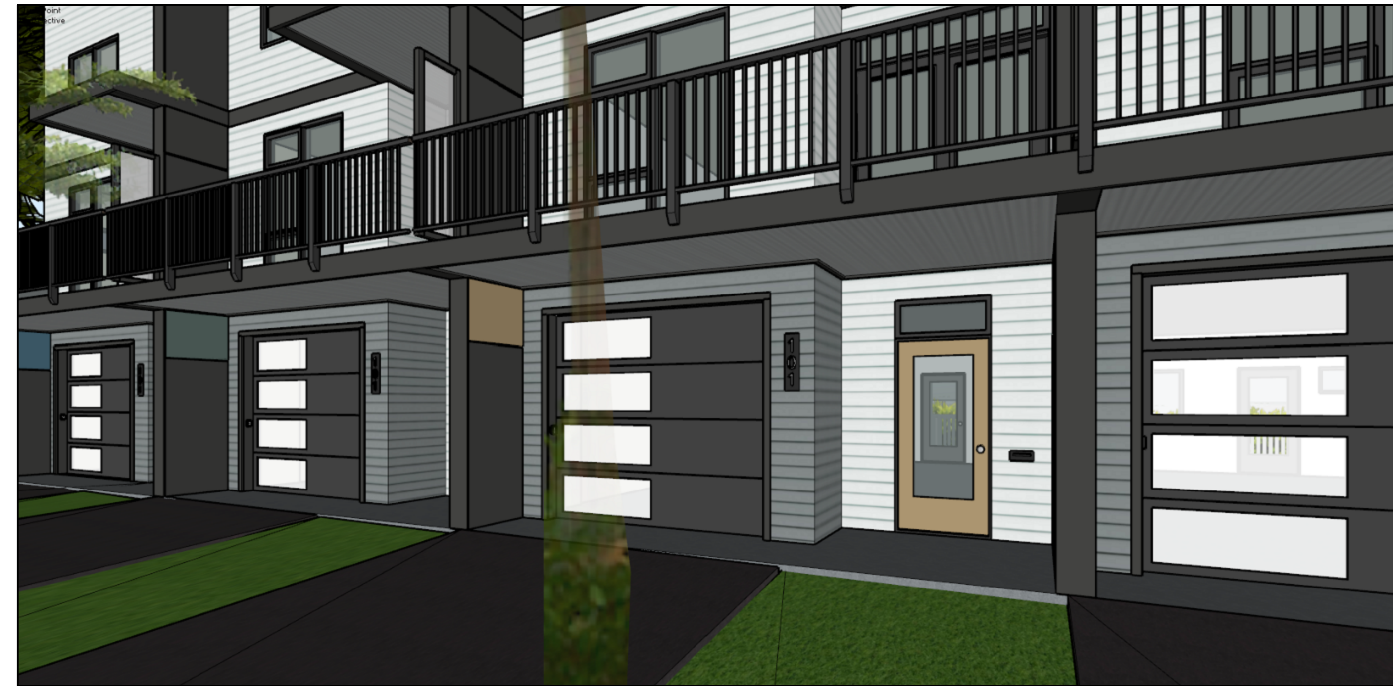
4 Typical Front Entrance N.T.S.