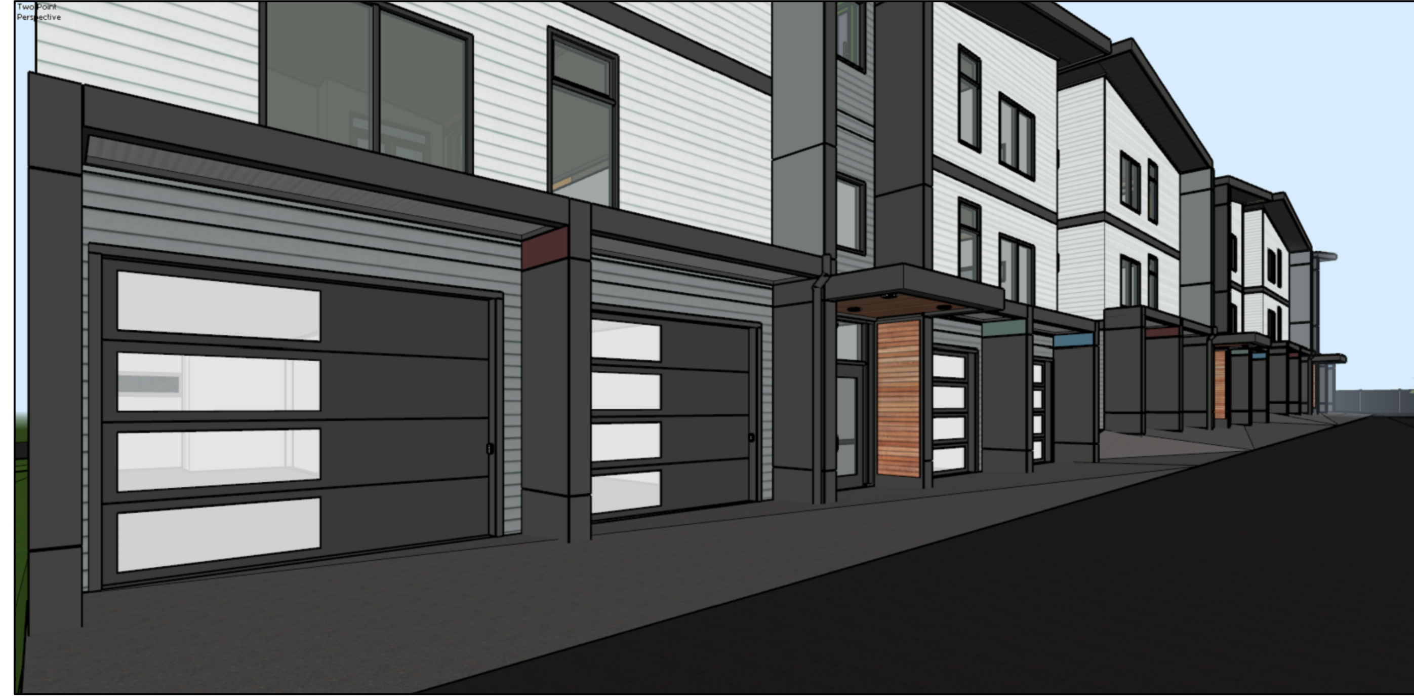
2 Typical Garage Entrance N.T.S.