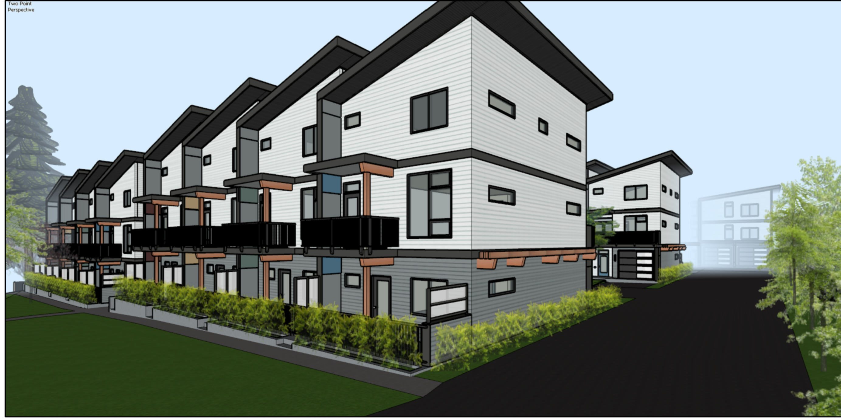
1 Looking down North Lane N.T.S.