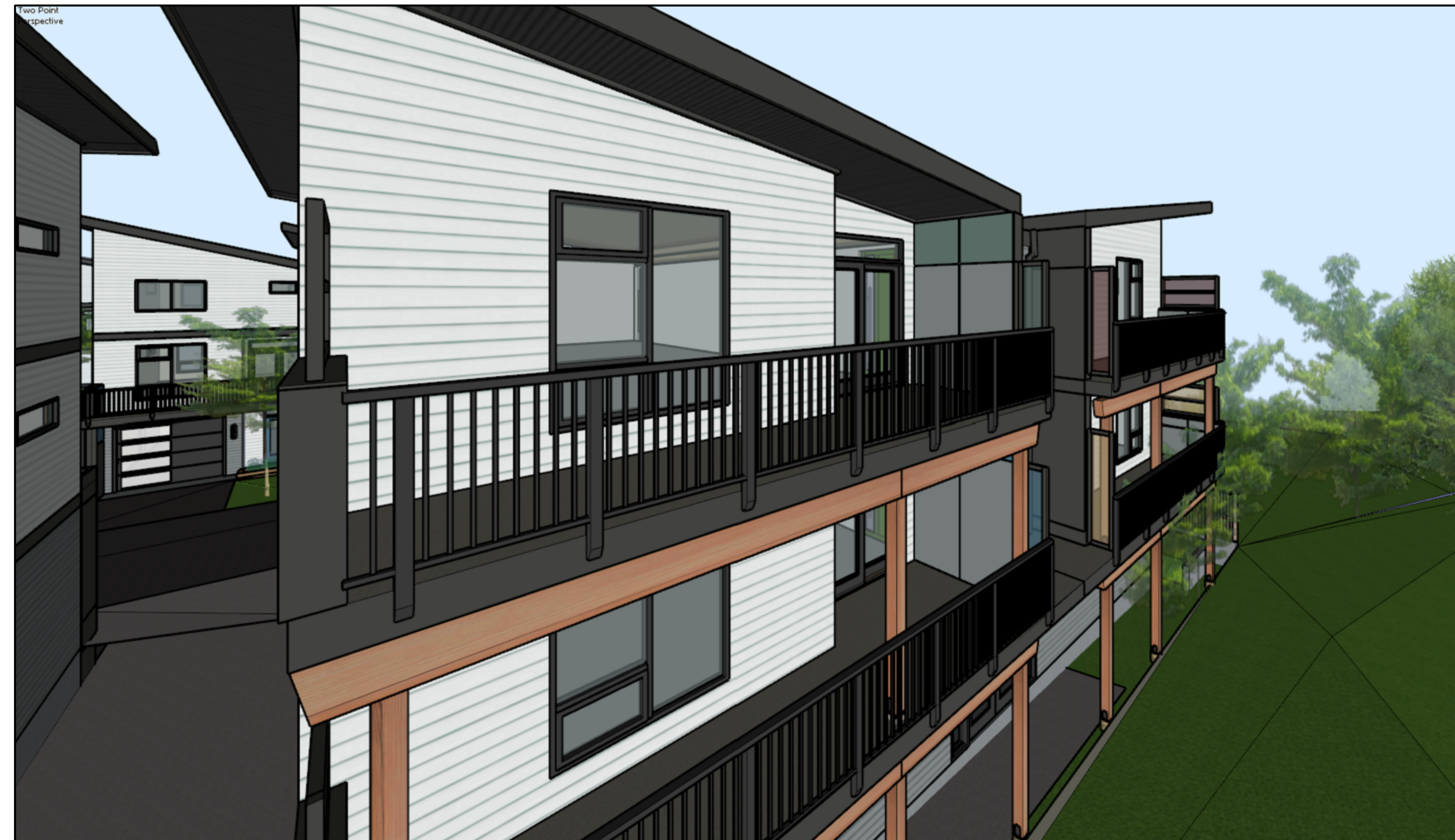
4 Typical Balcony N.T.S.